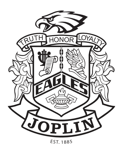
Single color Joplin Schools Crest